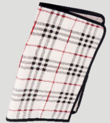
Full size waterproof Table mat, easy to clean