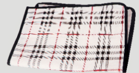
Full size waterproof Table mat, easy to clean