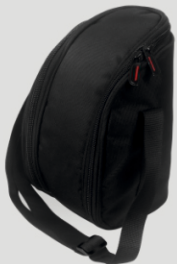
Comes in a premium, durable lunch bag