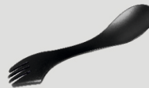
Spoon/Fork in unique reversible design