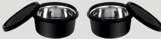
2 High grade Stainless Steel Microwaveable containers (400ml approx)