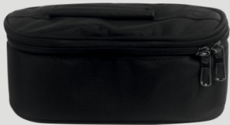
Comes in a premium, durable lunch bag