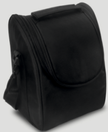
Comes in a premium, durable lunch bag