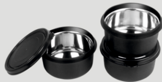
3 High grade Stainless Steel Microwaveable containers (400ml approx)